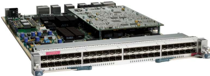
Figure 2. Cisco Nexus 7000 Series 48-Port 10/100/1000 Ethernet Module with XL Option (RJ45)